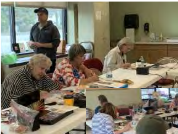
The Pencil Drawing Workshop was a success.